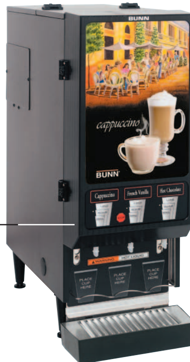
Model FMD DBC-3