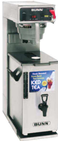
Model TW with Tea Funnel and TD4 Dispenser (dispenser not included)