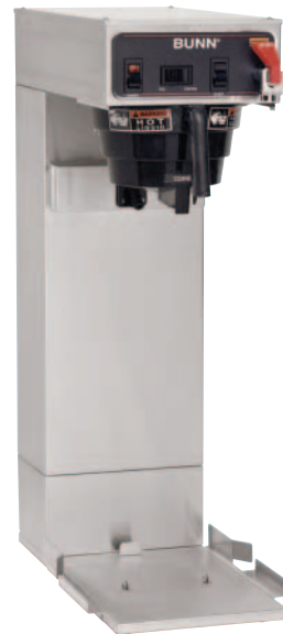
Model TW with Coffee Funnel