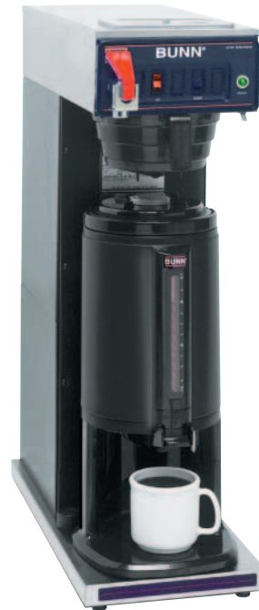
Model CWTF TS with Thermal Server