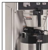
Stainless steel decor available.

(servers sold separately) Dimensions: 35.7" H x 12.1" W x 19.2" D (90.7cm H x 30.7cm W x 48.8cm D)