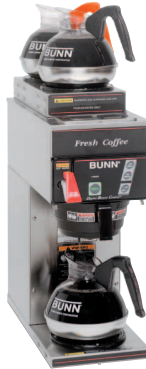
Model CDBCFCP (2 top warmers) (decanters not included)