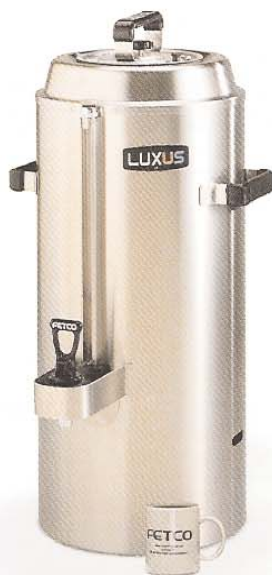
TPD - 3.0 Gallon LUXUS® Thermal Dispenser

Provides the ultimate in hot and cold beverage dispensing. Totally portable, they require no electric power to maintain temperature. You can prepare them ahead of time. Once filled and capped, they go anywhere. Ready to act as your remote dispensing station wherever needed. Indoors, outdoors, on different floors, or placed throughout a restaurant, hotel or office for hours of fresh hot coffee service. LUXUS® thermal dispensers can be staff operated or used as a self-service system.