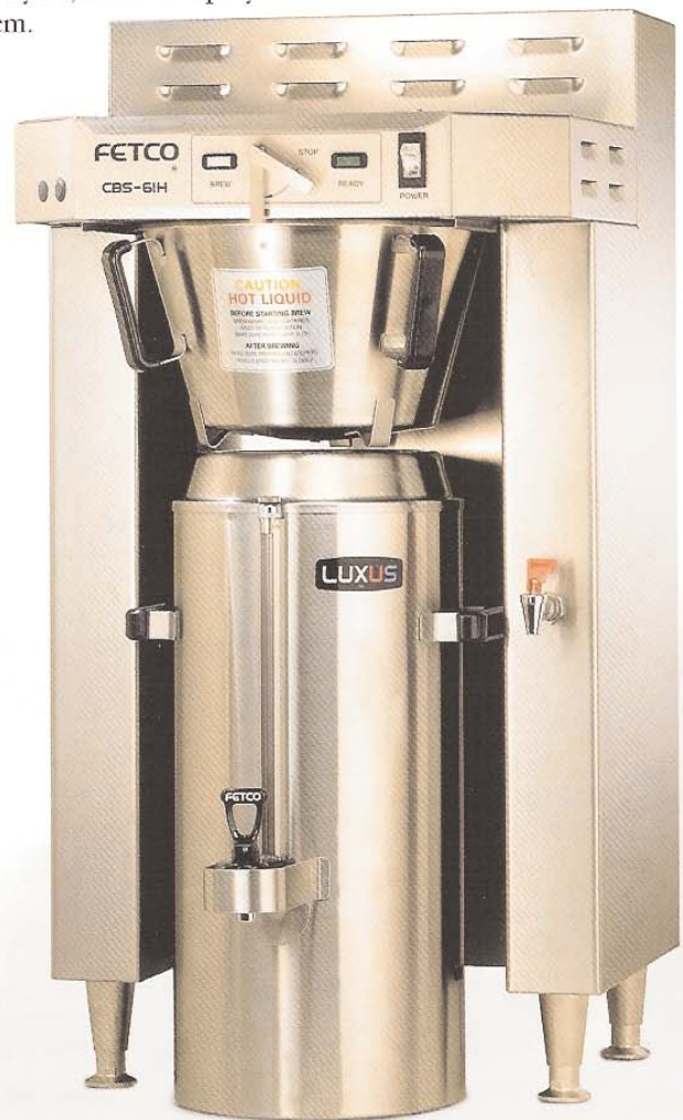
CBS-61H30 in Stainless Steel Finish and with 3.0 Gallon LUXUS® Thermal Dispenser